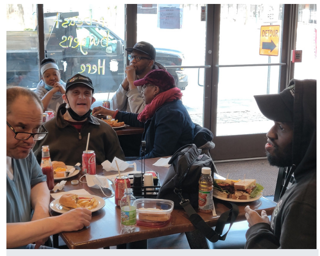
TransitionPlus and Dayhab engage in weekly peer shadowing and try various cleaning tasks at the restaurant, then enjoyed a wonderful lunch at the cafe.

Planning is underway to re-imagine our market central training area into an in-house restaurant. Inroads offers a variety of employment readiness certificate programs including, ServSafe Food Handler and Janitorial Skills Training.