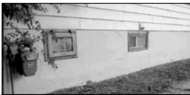
FOUNDATION REPAIRS BEFORE & AFTER