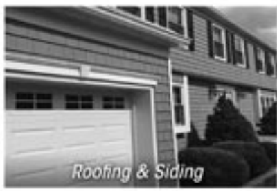
Roofing & Siding