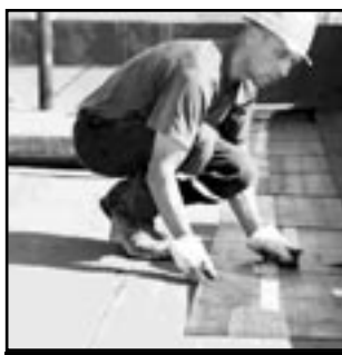
FLAT TOP ROOF