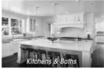
Kitchens & Baths