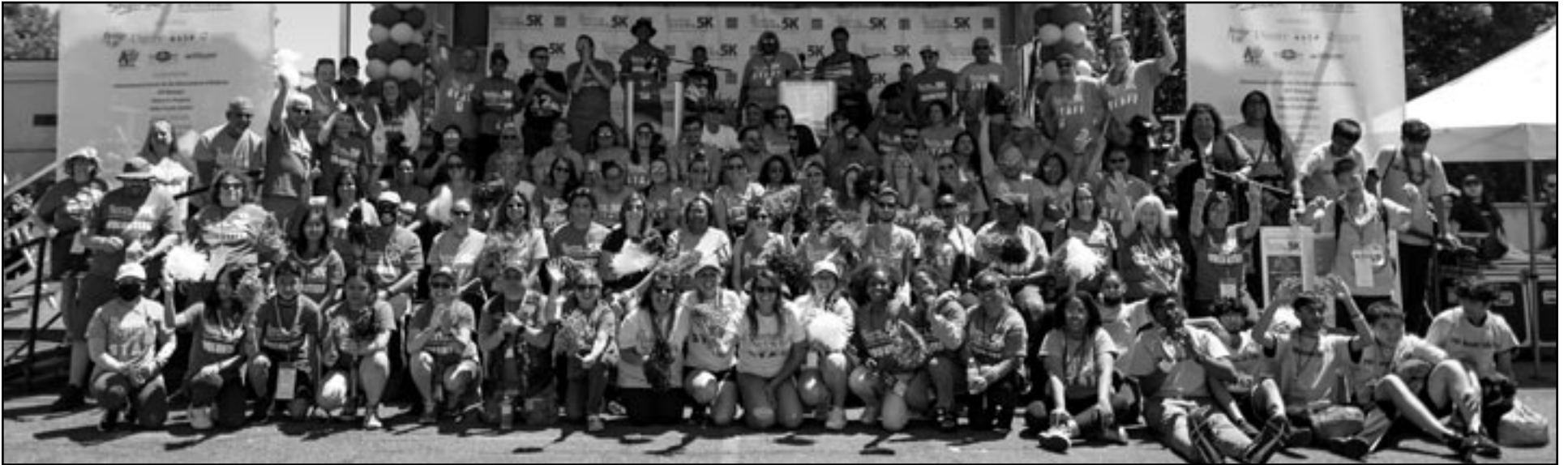
(above) NJ Sharing Network's 5K Celebration of Life Will Unite Thousands of Organ and Tissue Donation Supporters in New Providence on June 11. To sign up to participate in the 5K Celebration of Life or make a contribution to a team, visit SharingNetworkFoundation.org/5K .

According to United Network for Organ Sharing (UNOS), there are over 100,000 Americans – nearly 4,000 of whom live in New Jersey – waiting for a life-saving transplant. One organ and tissue donor can save eight lives and enhance the lives of over 75 others. To learn more, get involved, and join the National Donate Life Registry as an organ and tissue donor, visit NJSharingNetwork.org .