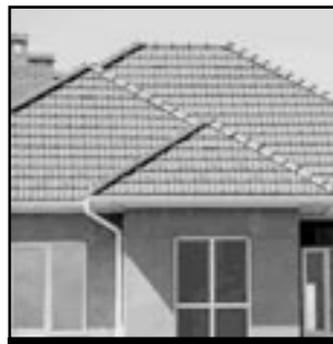
SPANISH STYLE ROOF