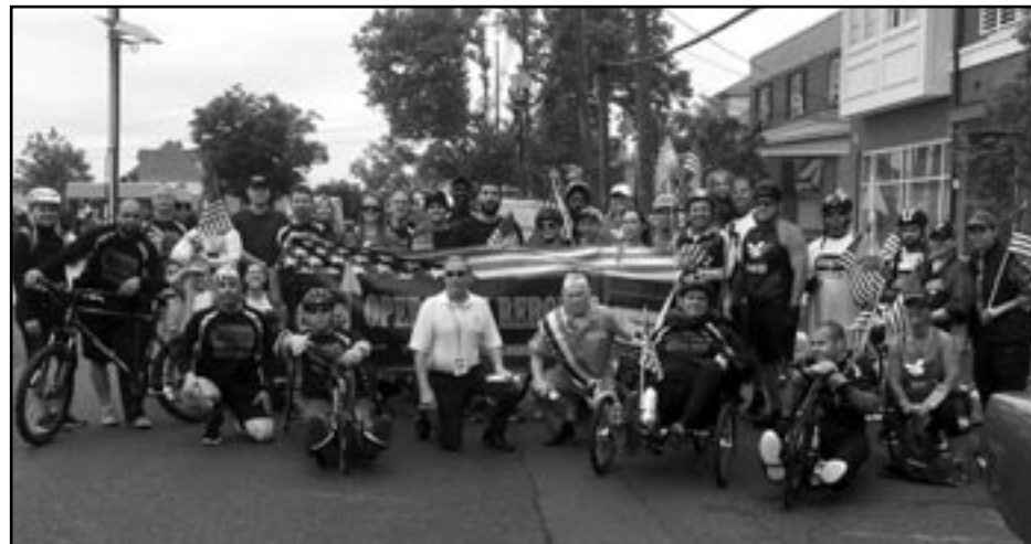
(above) New Jersey Veterans Network veterans and volunteers at a recent Memorial Day Parade.

For the last two years, our team has been working tirelessly with other charities to come up with a better solution to help prevent this epidemic from continuing. Personally, we believe our Mobile Outreach Team is really making a